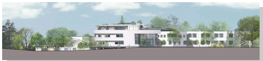
New Build: South Elevation

A detailed model of the new build together with the original display boards can be viewed in the Academy foyer.