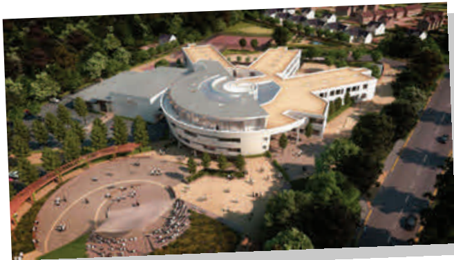
New Build: External Aerial View