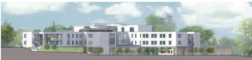
New Build: North Elevation

Large views of the plans and designs are available on the Academy website: