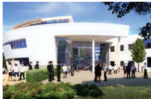
Academy New Build (additional Images inside)

demonstration and lecture theatre, improved sports facilities and an all weather pitch. In addition there will be a strong focus on outdoor learning with allotments, science ponds and a fusion garden.