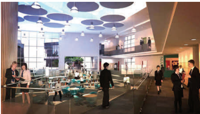
New Build: Internal View 1