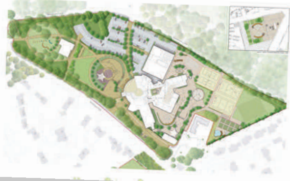
New Build: Site Plan