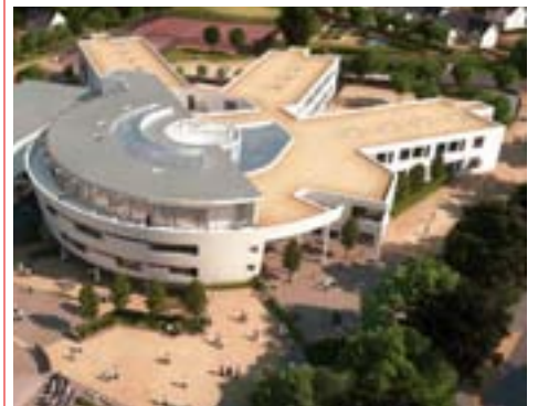
Visualisation of the Academy New Build