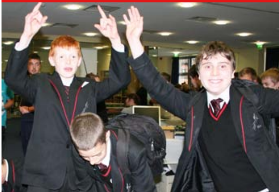
Academy Students at Skills Fest

Engineering, Biochemistry and Journalism - students get an insight into the world of work and study post 16.