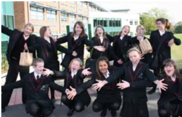
Academy Students at Tonbridge Grammar School for the LCO workshop

Twelve Year 7 students took part in singing and instrumental workshops at Tonbridge Grammar School this term.