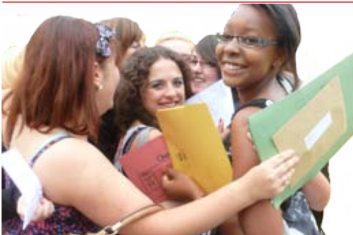
GCSE Results Day

Academy students gained record results in this year's GCSE exams.