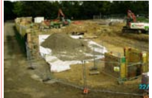
Site of the old music and drama blocks