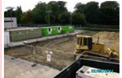
Preparing the ground for the new building

The Academy is celebrating the start of work on the new 21.4 million pound building. The old music and drama blocks have now gone and work has just begun on the foundations of the new building.